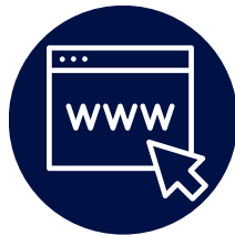
AARC Websites & Career Center