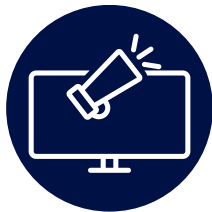
RC Buzz Newsletter