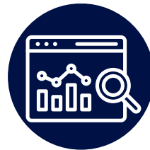
RESPIRATORY CARE Journal, Newsletters, Media