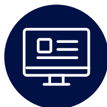
Sponsored Emails, Social Media, Podcasts