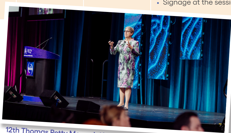
12th Thomas Petty Memorial Lecture, Congress 2024, Orlando, FL