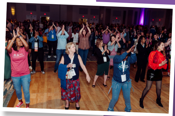
Attendees at the Congress Welcome Party