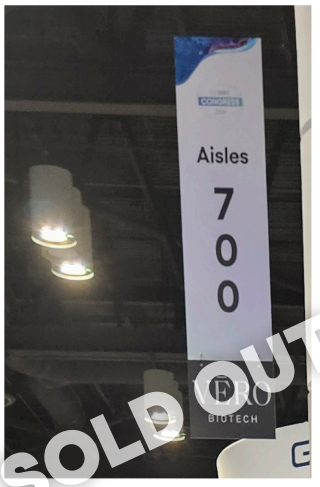
Hanging Aisle Signs direct attendees in the Expo Hall