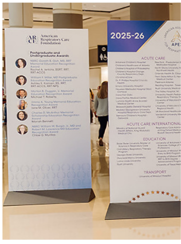
Freestanding Meter Boards are highly visible throughout the attendee areas