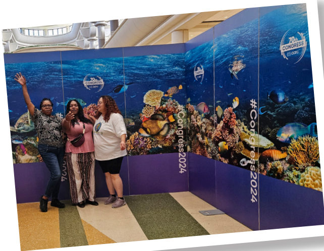
Branded Selfie Station gains organic exposure for your brand