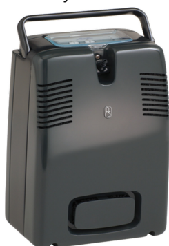
FreeStyle Model 3