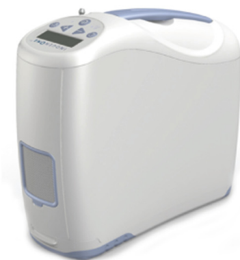
Inogen One G2